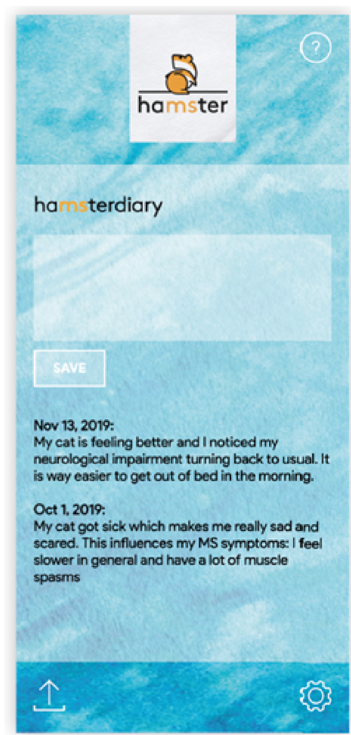
Figure 3. Sample entry for haMStardiary. The screenshot provided here has been translated from German to English for the purpose of this article.